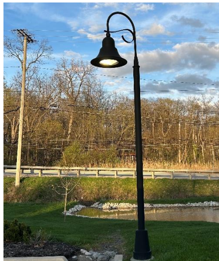
Figure 604-B – Cut-off light fixture example