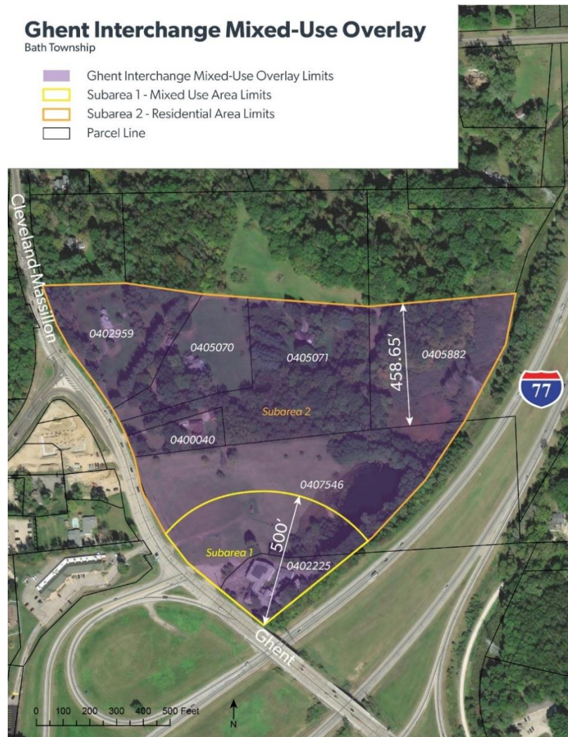
Figure 604-A – Ghent Interchange Mixed Use Overlay Limits

The limits of the Ghent Interchange Mixed Use Overlay are illustrated in Figure 604-A below.